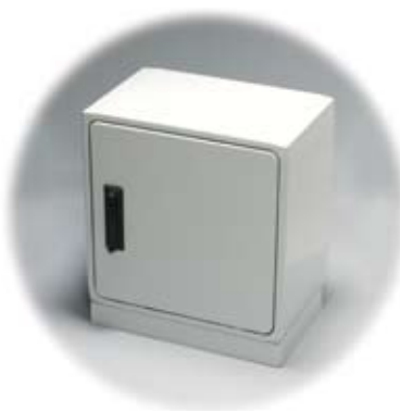
Floor mounting frame